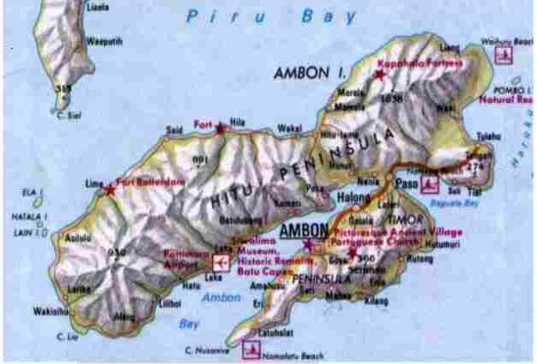
Figure 1. Research location the (scale 1:154821)

Material and Method. The study was conducted from September to December 2018 on Ambon Island, Maluku as shown in Figure 1.